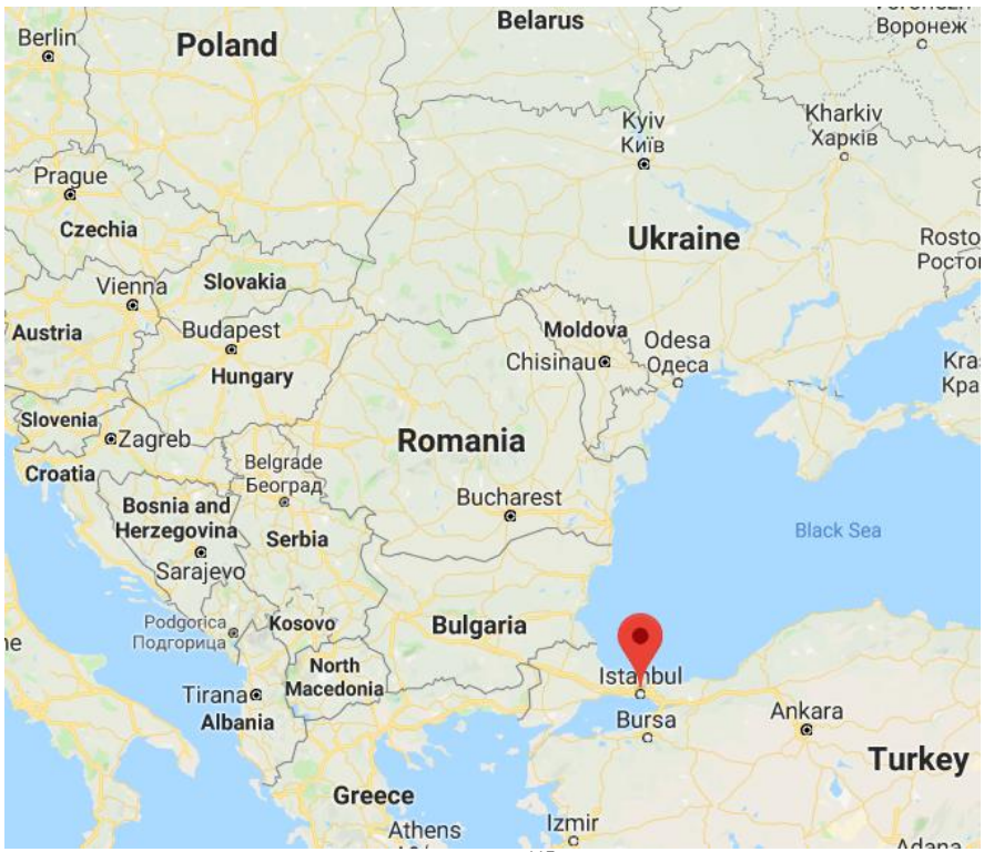
Exhibit 5. Map of Central Eastern Europe

Source: Adapted from Google Maps (2019) 117