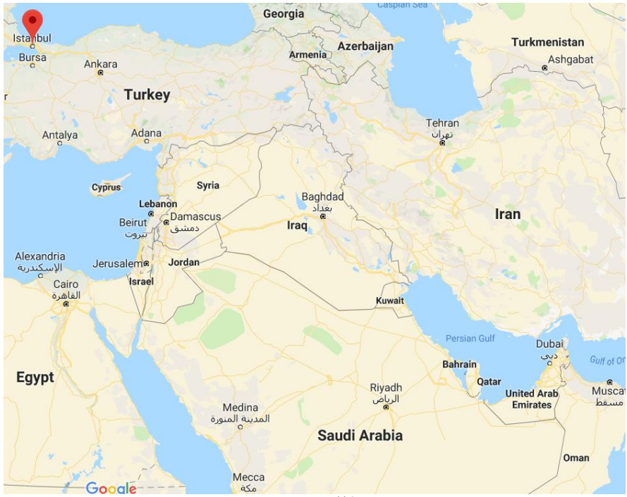
Exhibit 4. Map of the Middle East

Source: Adapted from Google Maps (2019) 116