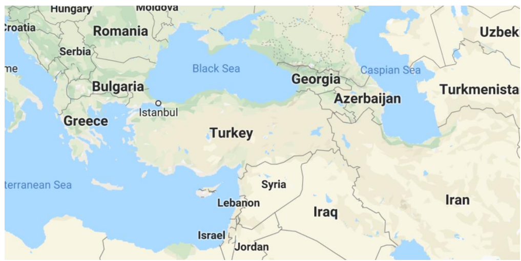
Exhibit 1. Map of Turkey