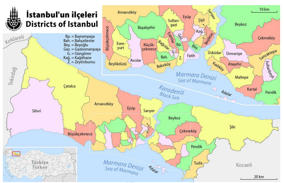
Exhibit 3. Map of Istanbul