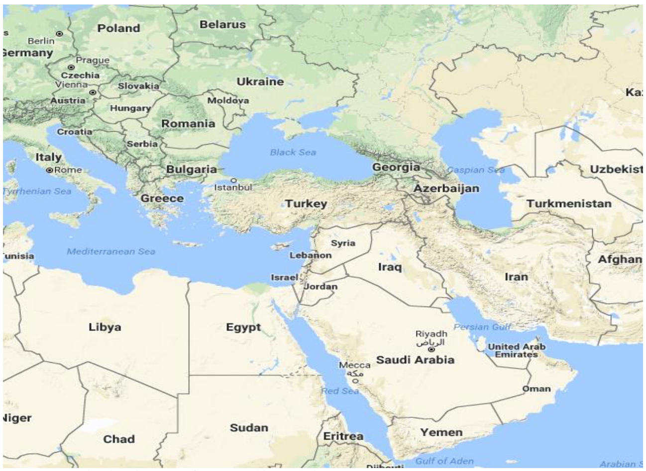
Exhibit 1. The map of Turkey and its neighbors